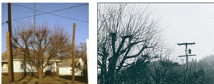
Figure 2. Examples of incorrect utility line clearance pruning.

In the past, utility company contractors would prune the least amount of material as they could. These contractors were often paid by the tree or by the mile for their work. This system resulted in pruning cuts that were often harmful to trees. It is often difficult to implement NTP in areas where substandard pruning has been performed. The trees in Athens-Clarke County are now having additional branches removed in order to correctly implement NTP. As these cycles continue, mature trees will adjust and young trees will be initiated to NTP methods. Eventually, utility line clearance pruning will become less noticeable and less damaging to our trees.