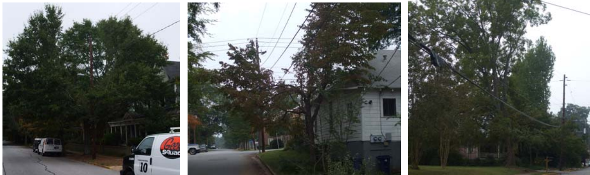
Figure 3. Examples of correctly performed natural target pruning.