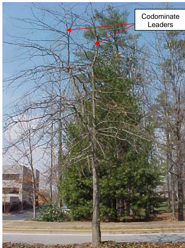
This tree has codominate leaders that can result in structural flaws that will shorten the tree's life.

Trees grow at the branch tips where the leading bud suppresses other buds behind it. This bud produces auxin, a plant growth regulator. This chemical allows the bud to maintain its position as leader by reducing the growth of its competitors. Remove this leading bud and the chemical is gone which pushes all of the other now uninhibited buds to assume the leader's former role; this chain reaction results in bushy growth with one or more branches competing for dominance as equals. These equal branches compete for resources and space. Eventually, they can create weak spots in the trunk that can result in the tree splitting.